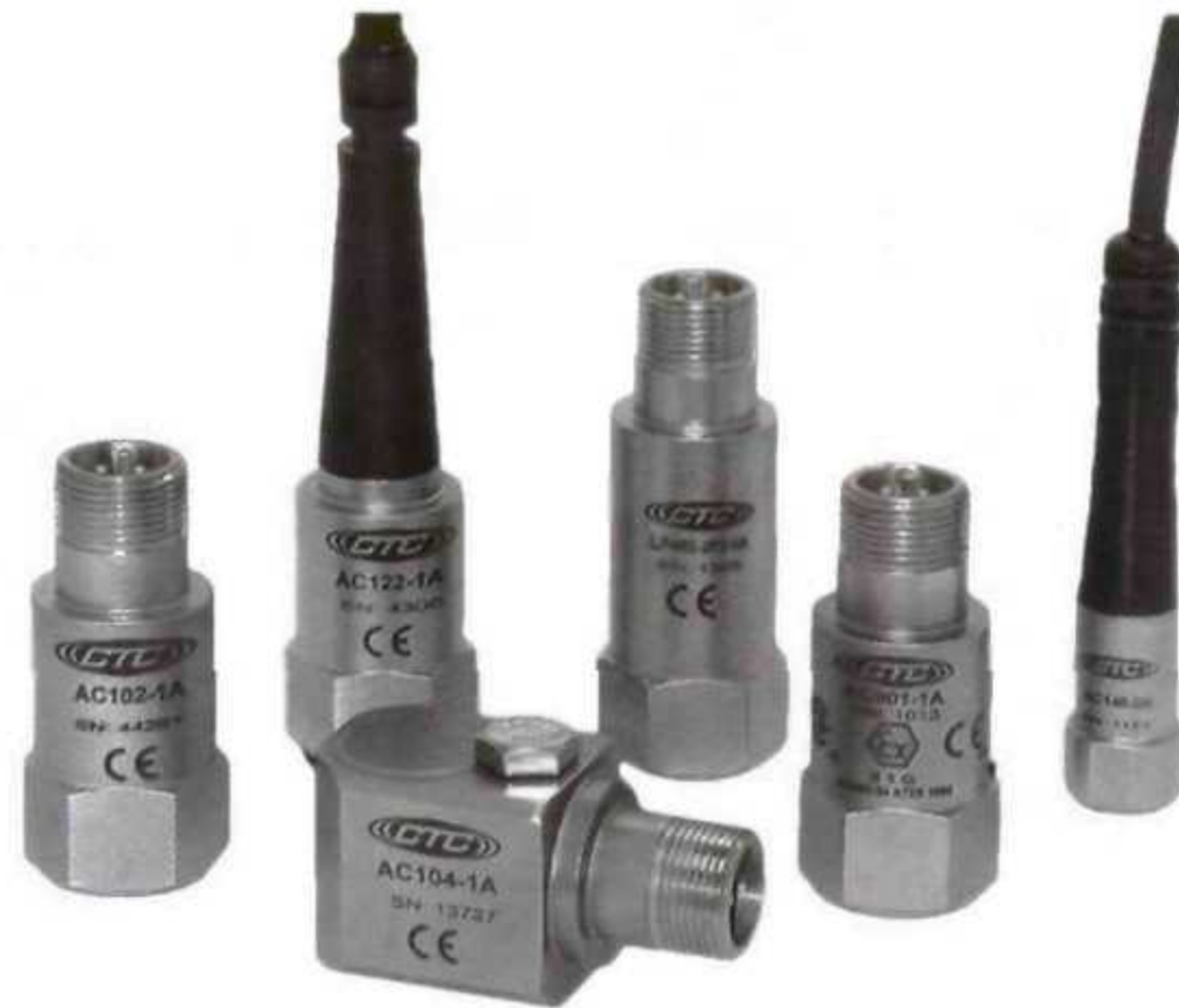
Vibration sensors which form part of vibration monitoring systems used by Engineering Dynamics.

Christo stresses that one of the most important aspects of good maintenance is frequently having the machine's oil analysed. He says, “Oil condition monitoring is vital in the upkeep of your machines. In the case of truck fleets, owners are very conscious of the wear within the engines and obviously would like to extend the life of the vehicle.”