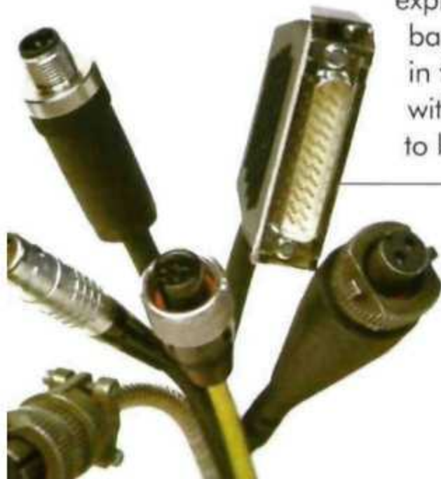
Cable grouping as used in vibration monitoring.

WearCheck analyses 550 000 samples from across southern Africa every year. They capture information from the machinery under analysis and add it to their database. John explains, “This allows us to increase our knowledge base. We pass this knowledge on to our customers in the training courses and we illustrate the theory with meaningful, practical case studies – all related to local conditions.”